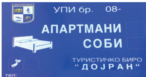
Figure 2. Touristic table

The tourists can choose between hotel accommodation and private accommodation. Hotel accommodation is accounted to quite small percentage due to the fact that most of the existing hotels are ruined and closed, while private housing in recent years has slowly began to meet customer needs. For this purpose, the registration of accommodation capacities has been conducted for years and they're ranked by the municipality. According to the new Law on hospitality and Law on tourist activity, there is an authorized municipal inspector who supervises the application of these laws.